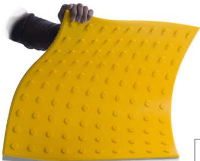
Flexible urethane material bends and conforms to slopes, curves and other irregularities.